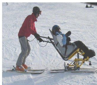
Piloted tandem skis