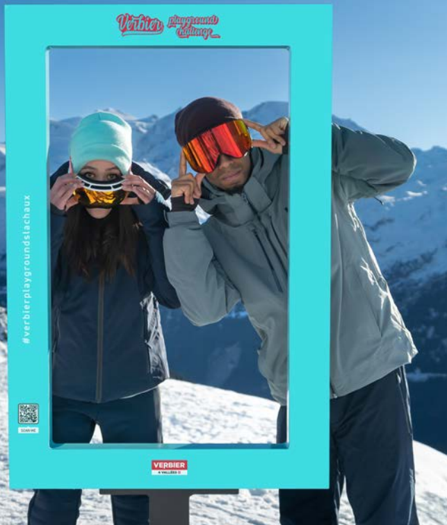
PHOTO COMPETITION - VERBIER PLAYGROUND CHALLENGE